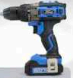
F18-01 18V Drill Driver