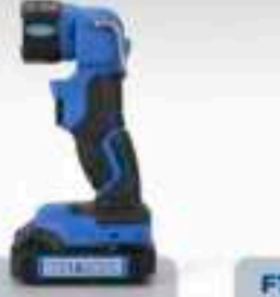
F18-05 18V Flashlight