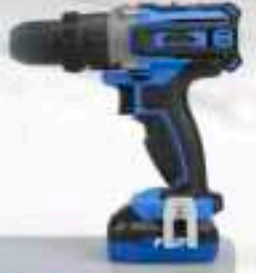
F12-02 12V Impact Drill