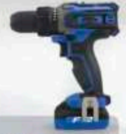
F12-01 12V Drill Driver