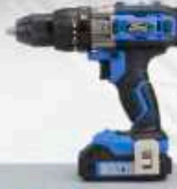
F18-02 18V Impact Drill