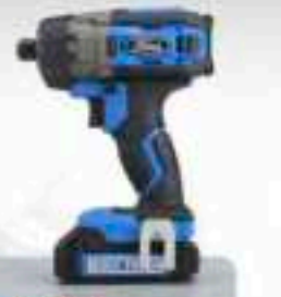
F18-03 18V Impact Driver