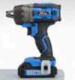
F18-04 18V Small Body Impact Wrench